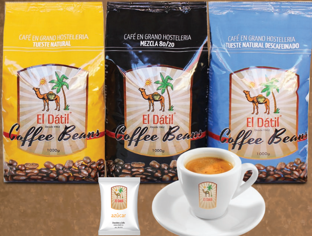
Sugar in sachets